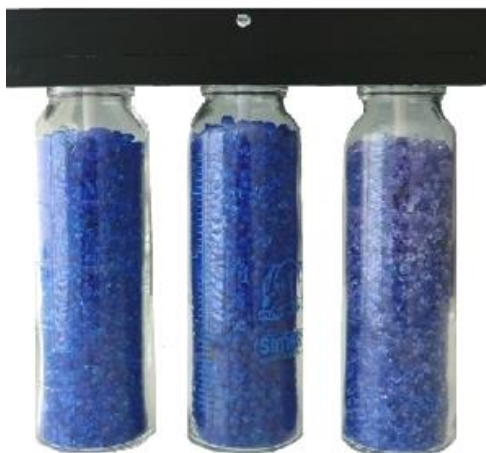
Assembled bottle array for silica gel