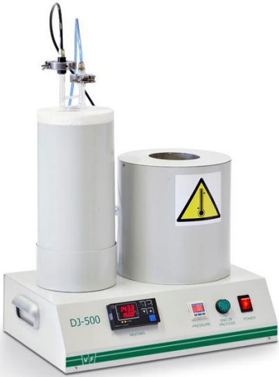
DJ-500 Desorption Unit