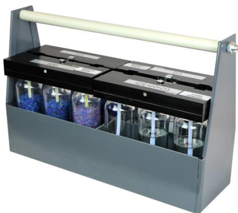
Transport box for sampling bottles in the holders