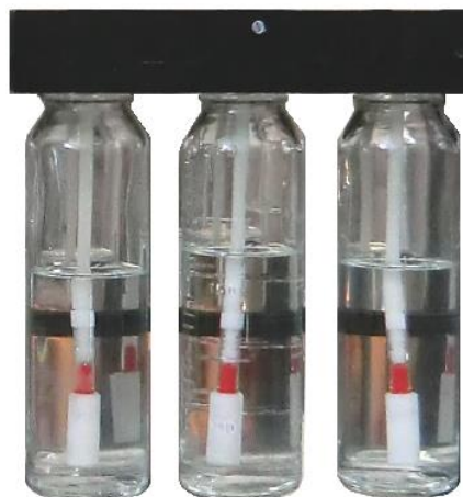
Assembled bottle array for NaOH solution