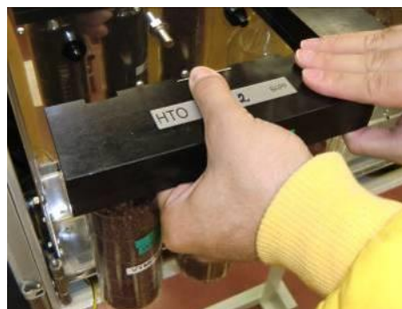
Insertion of the holder with sampling bottles with silica gel