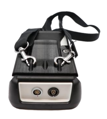
RadCount-3 with a shoulder strap