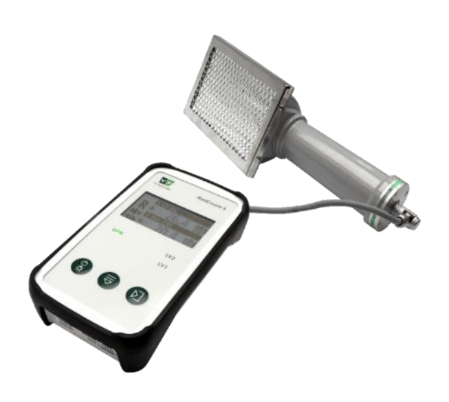
RadCount-3 with a connected SFP-100 probe