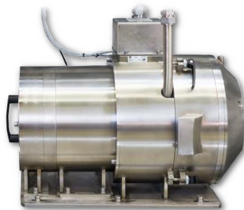
CID-03 Continuous Iodine Detector

Design optimized for accident and post-accident operation